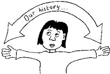
Kathie Phelps & Alan Vaughan

If you need to travel with someone who can help you, we can also do that. If we can't go with you we can find someone who can. You can meet them and plan your holiday together.